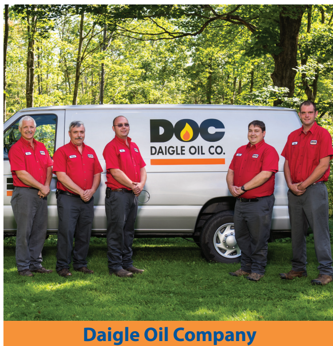
Daigle Oil Company